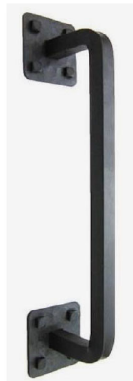
Drawing 4: Detail of hanging sign and grab handle No39 Church Street Tewkesbury

Grab Handle: Simple traditional Wrought iron handle (similar to example show) to be installed on the left hand jamb of the front door. To be finished in black.