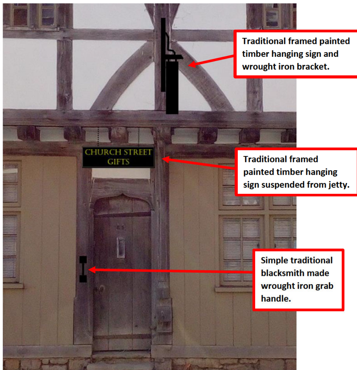
Drawing 2: Detail of proposed front elevation No39 Church Street Tewkesbury